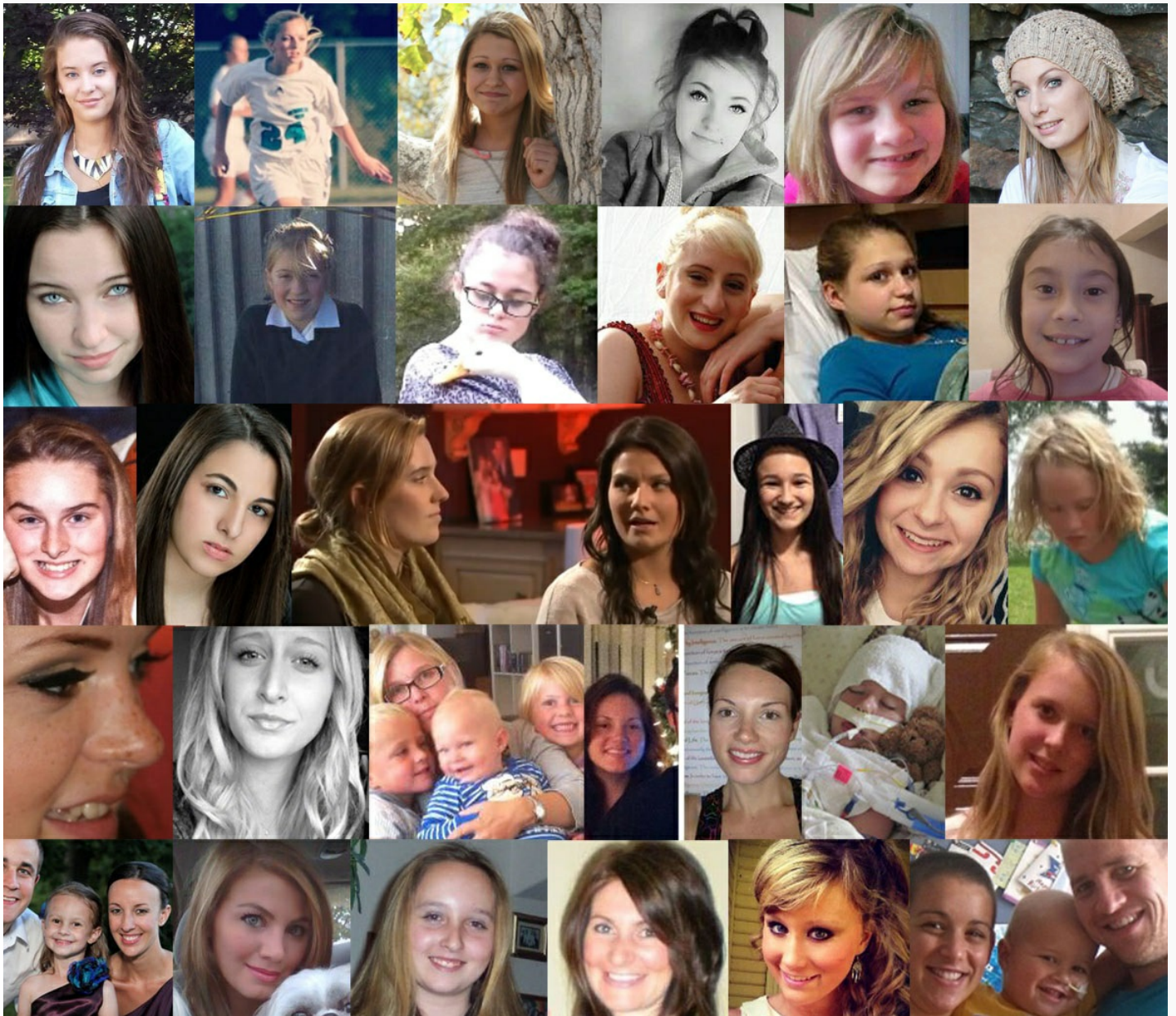
Young women whose lives were destroyed by Gardasil.

Gardasil: The Decision We Will Always Regret