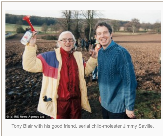
Tony Blair with his good friend, serial child-molester Jimmy Saville.

Are they willing to engage in pedophilia; are they willing to sell their soul to Lucifer (Satan); are they willing to murder or deploy murder or mass-murder by creating wars to depopulate the Earth and make huge war profits and steal others natural resources? If so they move up. There is no room in this hierarchy for anyone with a human soul left inside them and they must become Satanic sellouts and pedophilic murderers and human vivisectionists to advance to the top circles of power.