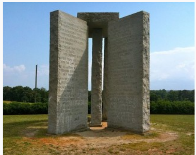
Georgia Guidestones which contain the blueprint for the Globalists' NWO and their plan for 90% depopulation of Planet Earth and their own New Ten Commandments.