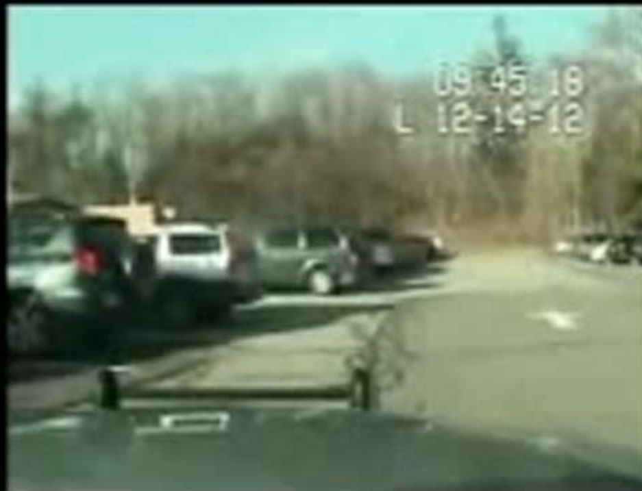
Police car arrives on scene at Sandy Hook school and stops at exactly 09:45:18 a.m. on 12/14/12 (per dash cam). This video is labeled 00055705 in the state evidence file.